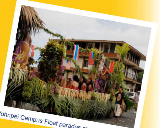
Pohnpei Campus Float parades at main road Kolonia