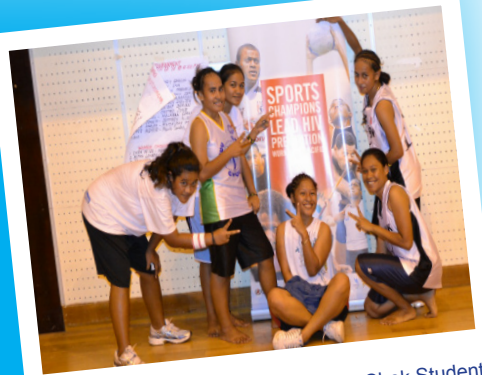
Womens basketball Champions ChuuChok Students