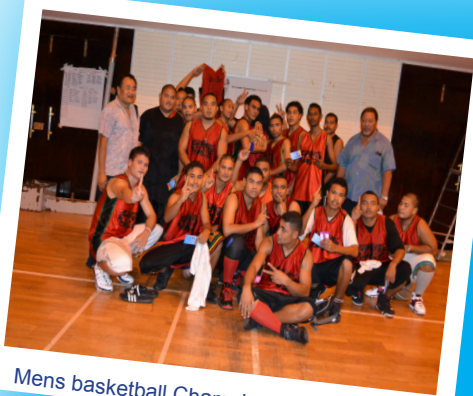
Mens basketball Champions YSO Students