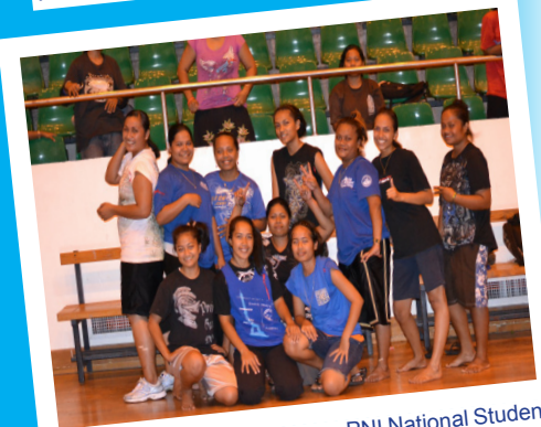
Womens Volleyball Champions PNI National Students