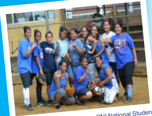
Womens Softball Champions PNI National Students