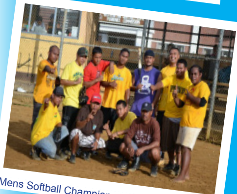
Mens Softball Champions PNI National Students