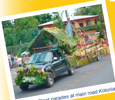
Sapwafik Float parades at main road Kolonia