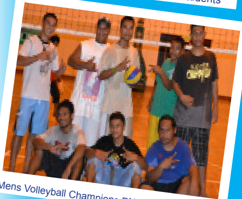
Mens Volleyball Champions PNI National Students