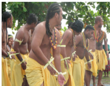
Chuuk Campus Students performing their dance