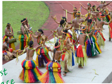
YSO Students performing their dance